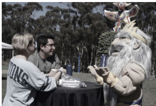
King Triton gives advice at Psychology Senior Send-Off 2018

All courses taken at another university must be petitioned for use toward majors within our department. We do not have articulation agreements with other universities, including other UC schools. A maximum of three upper-division courses (4 units each) from outside of UC San Diego may be used toward majors within our department.