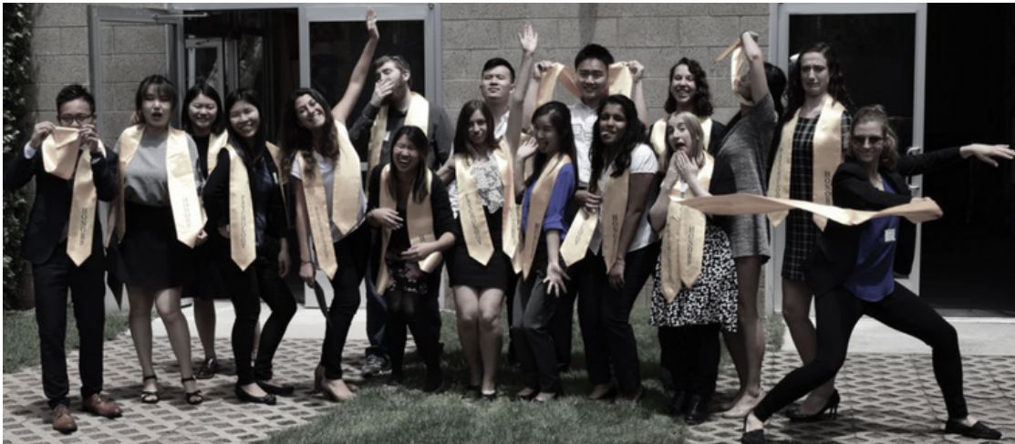
2017-18 Psychology Honors cohort

Are you considering graduate school or a professional program? Are you interested in conducting original research? Apply for the Psychology Honors Program! Conduct your own research project, learn to manage a project from beginning to end, get to know advising faculty, and gain an advantage for admission into graduate schools. For more information, come by the department and check out the website . Applications will be available online in early November!