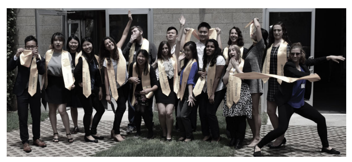
2017-18 Psychology Honors cohort

Are you considering graduate school or a professional program? Are you interested in conducting original research? Apply for the Psychology Honors Program! Conduct your own research project, learn to manage a project from beginning to end, get to know advising faculty, and gain an advantage for admission into graduate schools. For more information, come by the department and check out the <u>website</u>. Applications will be available online in October, and are due on November 13th!