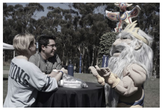
King Triton gives advice at Psychology Senior Send-Off 2018

All courses taken at another university must be petitioned for use toward majors within our department. We do not have articulation agreements with other universities, including other UC schools. A maximum of three Upper Division courses (4 units each) from outside of UC San Diego may be used toward majors within our department.